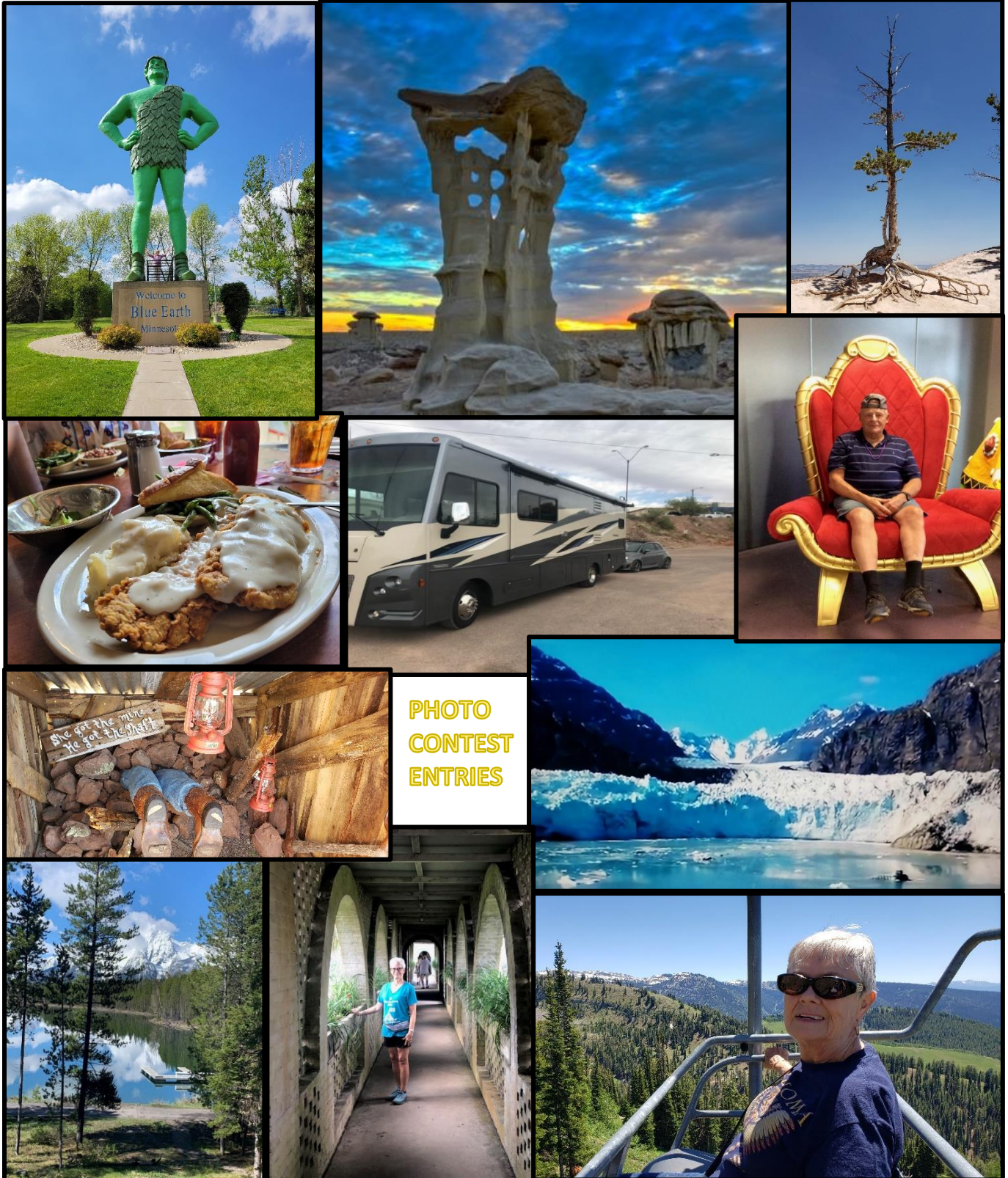
PHOTO CONTEST ENTRIES

All entries must be received via email, tom1st@comcst.net , by 14 October and will be displayed and voted on at the October rally at the Pima County Fairgrounds. Remember, only one entry per couple. Below is a collage of some of the entries.