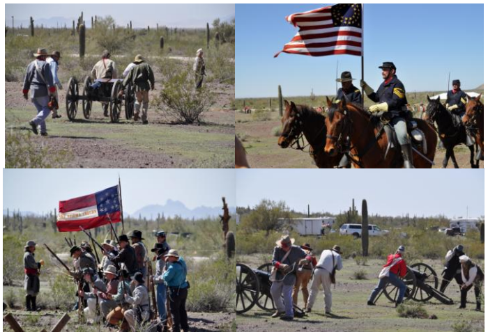
and visit to the neighboring Ostrich farm

Our March rally at Picacho featured Civil War battle reenactments,