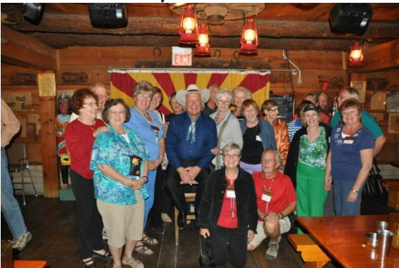
Singing along with Hank Williams Jr.