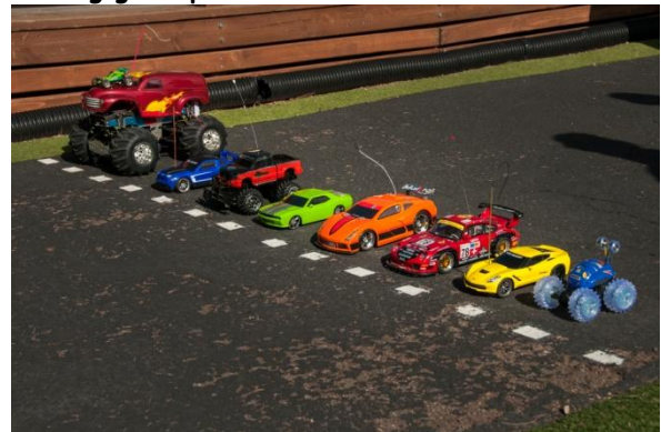
Auto Racing - sort of