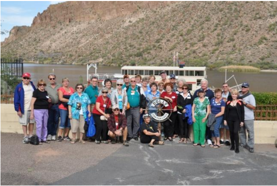
Steamboatin at Canyon Lake