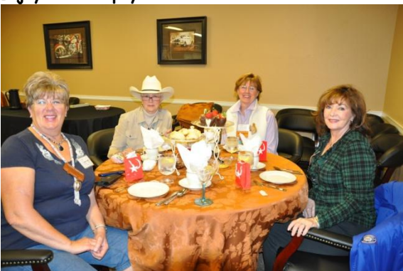
Having a Ladies Tea