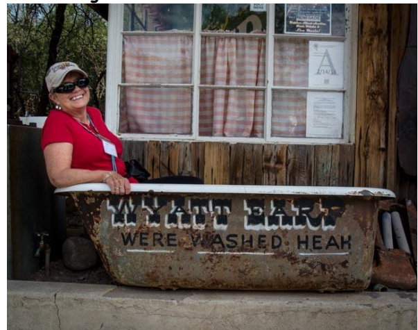
Just takin it easy ?