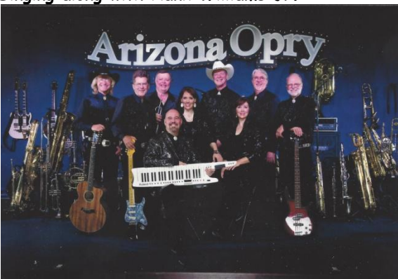
Enjoyin the Opry